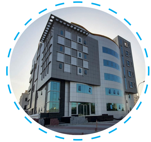
South AL_ Hayl

we felt that it is our responsibility to introduce an International Education under the Al-Awael umbrella to serve our future leaders, and prepare them to become international citizens. Proudly, this year we are opening our new branch that is equipped with topnotch technology and international A's and A-level education; it is expected to start from the next academic year 2021/2022.