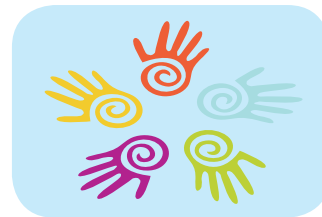
Enjoy, discover and achieve through learning