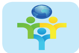
Make a positive contribution to our society